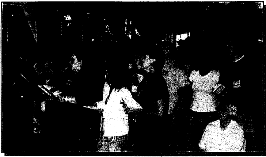
Is there any sound as sweet as Crestridgers singing? A singspiration and a chapel service gave us a chance to make a joyful noise to the Lord.